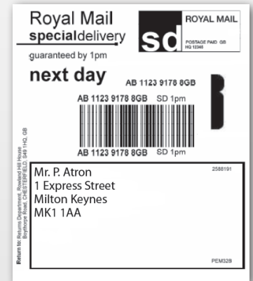
Figure 2: Example Label

'We are very pleased with what's been achieved. Our customer service has improved and we're able to confirm with customers their tracking number immediately, whereas previously we had to search through Special Delivery books which was time-consuming and not very customer-friendly.' Graham Smith, Head of Ticketing - Chelsea FC